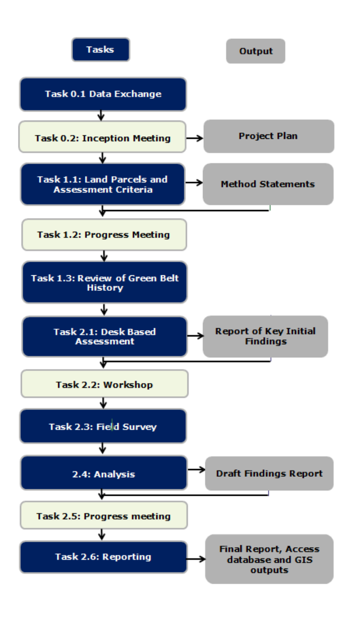
Figure 3.1: Methodological Flow Diagram